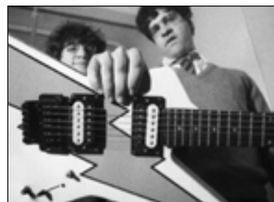
We Are Wizards